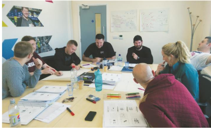
Only if there is too much of this....